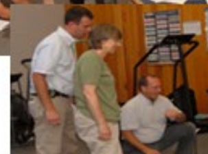
Static & Stance Evaluation