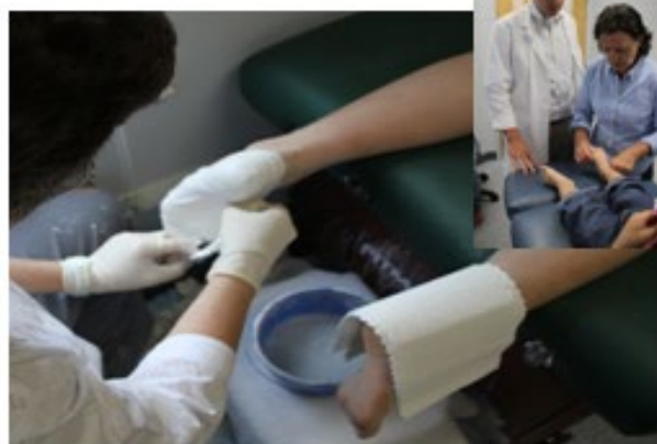
Measurements & Casting