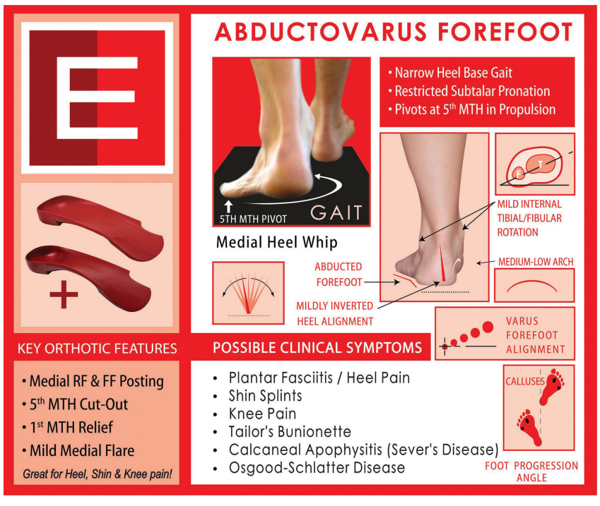
Figure 3: Adult orthotic recommendations for the E-Quad foot type typically include a moderate heel cup depth with medial rearfoot posting, and extrinsic medial forefoot posting with a 5th Met cut-out.

In the 11 + population, the E foot type presentation can add some more symptoms to the list. While Sever's, Osgood-Schlatter's, and growing pains can still persist, often kids involved in running sports will report a prevalence of shin splints, tibial stress fractures, and lower leg compartment syndrome. It is in fact the rapid abductory twisting of the E-Quad foot type which can cause tremendous torque forces on the lower leg, inducing these chief complaints. What is so remarkable is that often teenagers with one of these presenting symptoms will tell you that they also had growing pains as a "kid." They will often communicate that they have been suffering from these issues for a while, and no one ever watched them walk! They also may tell you about many of the plethora of symptoms described here that