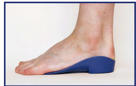
Outside of Left Foot

Gait Plates work by utilizing a semi-rigid shell that extends laterally beyond MTH's 4 & 5 to effectively alter the break of the ball of the foot during propulsion to encourage out-toeing of the limb at the hip. The littleSTEPS ® Gait Plate further addresses the foot pronation associated with in-toe gait by incorporating the features of a functional FO (deep heel cup, medial rearfoot posting and skive) to control subtalar joint pronation during contact and midstance phases of gait.