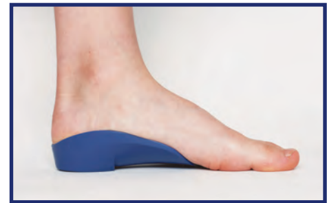
Inside Arch of Left Foot